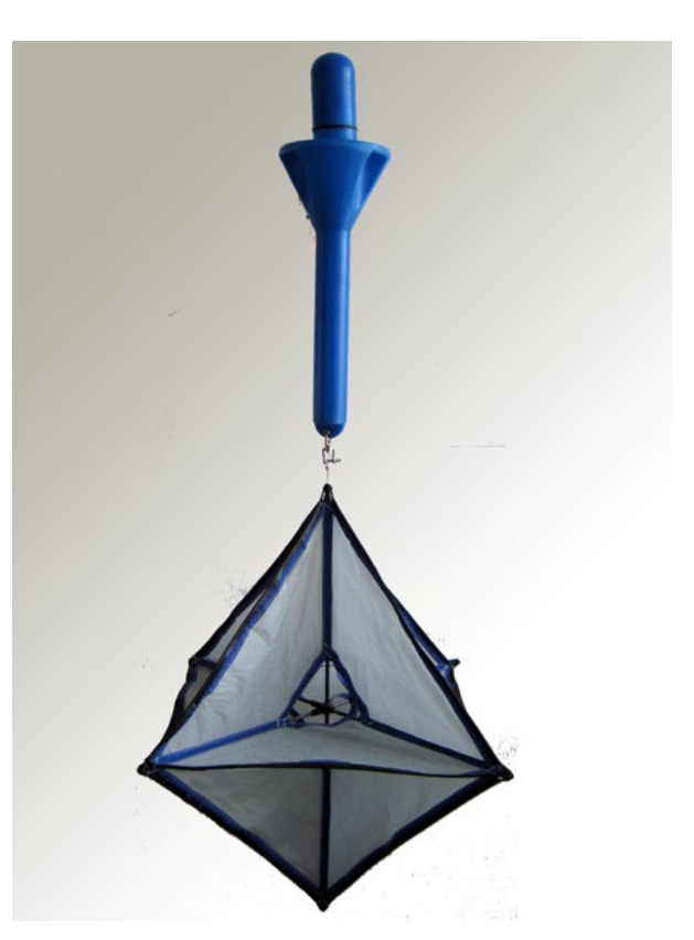
Figure 2. Lagrangian drifter equipped with a Davis-type drogue centered at 1 m depth.