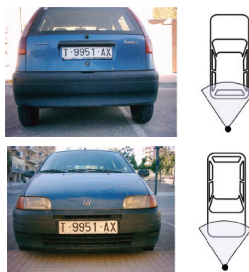
Figure 2 Valid camera positionation

The developed application can acquire images from different sources: webcam cameras, generic frame grabbers, Firewire 1394 cameras or images files.