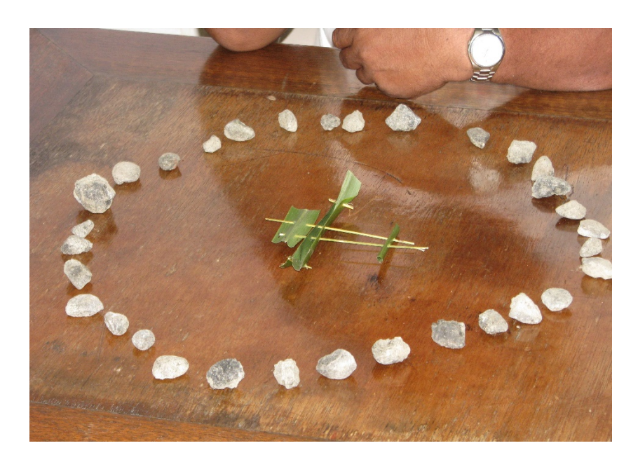
Figure 4: Tradition tool for teaching and memorizing star progression

I believe that the Marshall Islands and Waa'gey vignettes encapsulate the urgency for action in the face of climate change effects that are undermining the ability to live on these atolls and islands. The Marshall Islands are already losing land through coastal erosion, and the outer islands of Yap face mounting existential threats to rapidly changing environmental conditions. The Islanders need economic opportunity, which they are already partially linking to traditional culture and knowledge. They are at the epicenter of climate and social-cultural-ecological change.