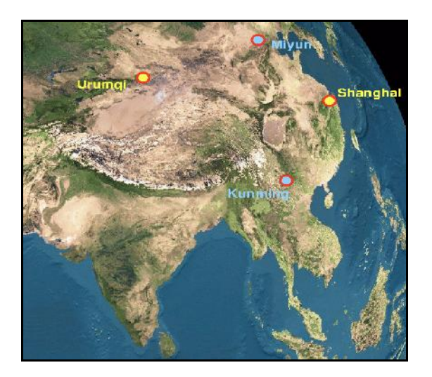
Figure. 2. Satellite Earth image showing the location of Chinese VLBI stations currently participating in the European VLBI network (adapted from http://www.evlbi.org).

Astronomical Observatory (SHAO) is the Chinese institution where VLBI was first introduced in the country back in 1972 (see Zhang et al. 2010 for a review).