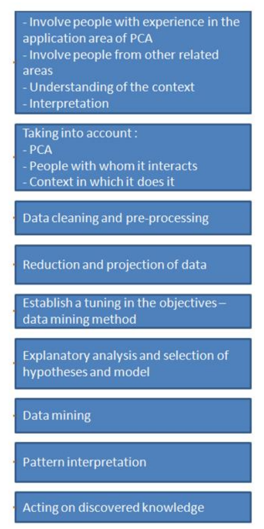
Fig. 2. KDDIAE.