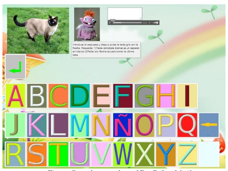
Fig. 1. Sample snapshot of Dr. Roland [18].

Finally, Section 5 presents the conclusions and future work.